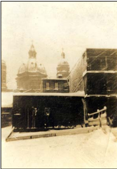
Harmar Street, winter, early 1930s

Here is a photo that I thought was lost forever. This was taken in front of the house I was born in at 324 Harmar, at the junction of Wiggins (which we always called Wayne Street). This is probably the Harmar garden now. The year was in the early 30's before the Big Flood of 1936, when the river overflowed and I remember the people coming up the hill for shelter.