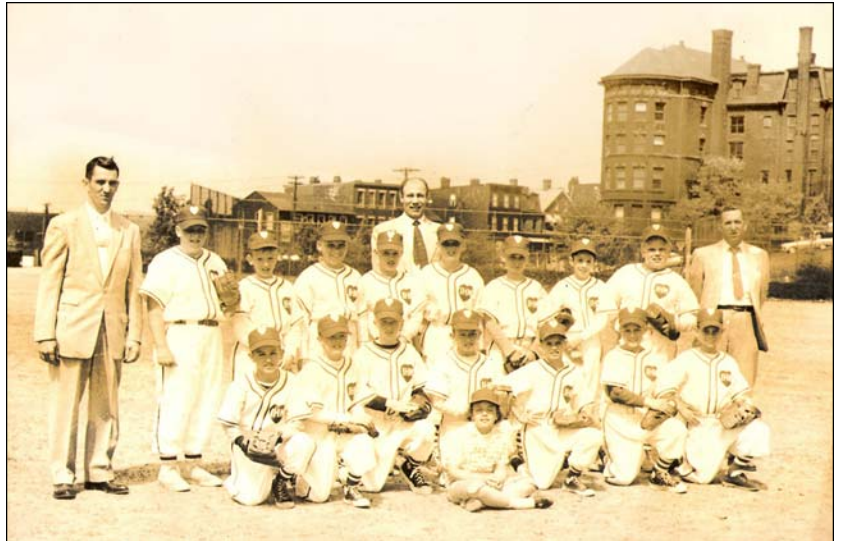
Baseball team on West Penn Field, 1950's.