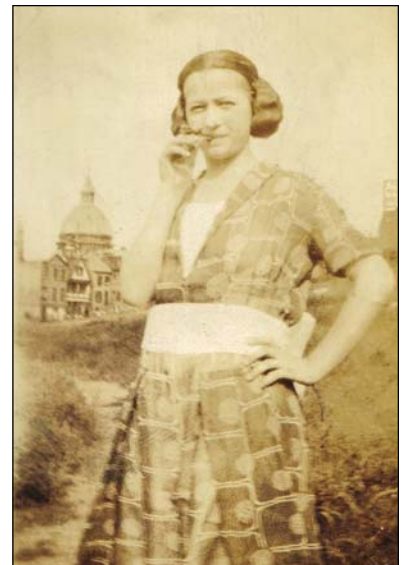
Girls hanging out at West Penn Field, 1920's.