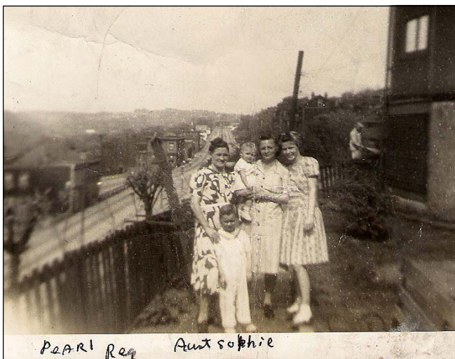
A family visit on Leander Street, 1940's. Bigelow Boulevard is visible below.