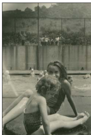
The old West Penn Pool, late 1950's.